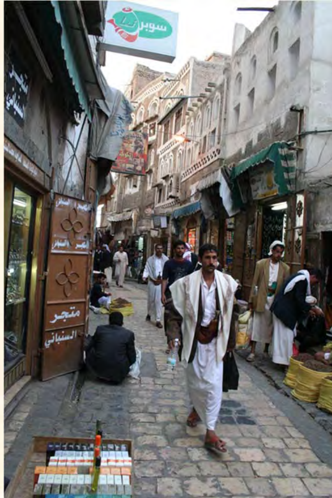
A commercial street in Old San'a', a World Heritage Site threatened by war