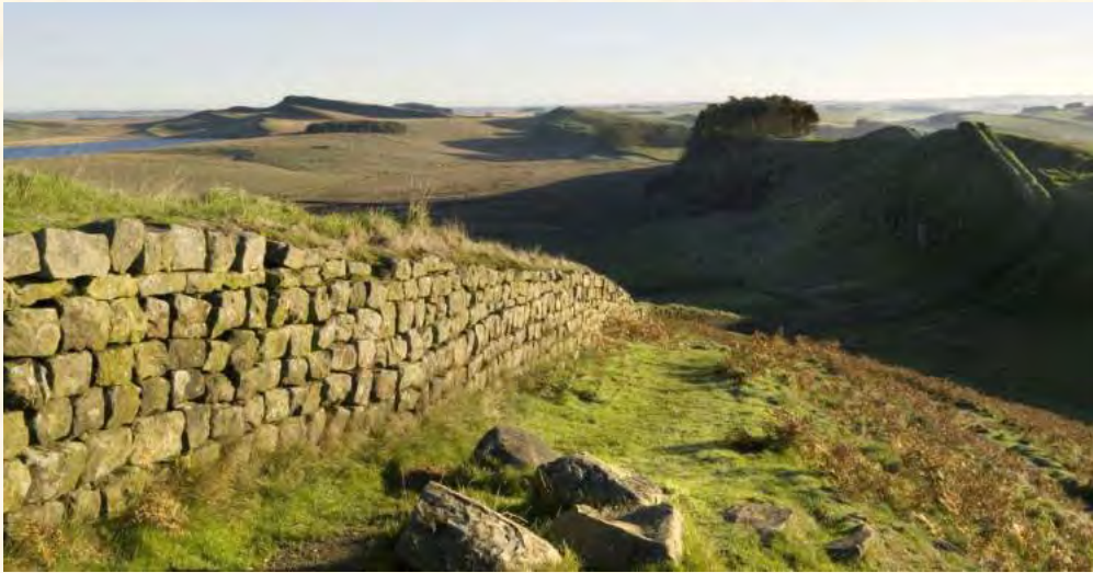
Hadrian's Wall, UK.