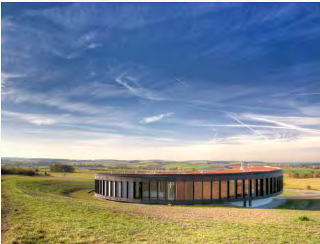
LIMESEUM in the Ruffenhofen Roman Park.