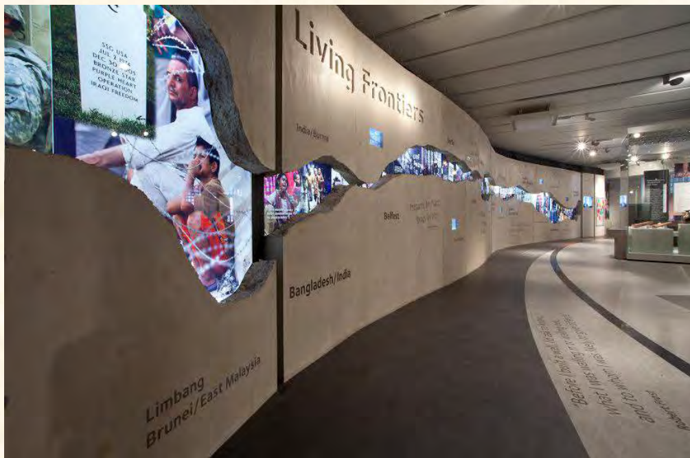
The „Living Wall“ in the Roman Frontier Gallery at Tullie House Museum Carlisle, UK, at the West end of Hadrian's Wall.