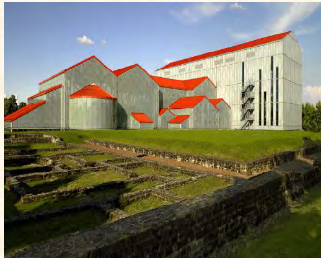
Above: The RömerMuseum in the LVR-Archaeological Park Xanten, Germany.