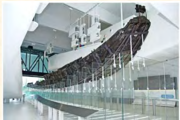
Above: Castellum Hoge Woerd, with one of the recovered Roman ships, in recent developed area of the City of Utrecht, Netherlands.