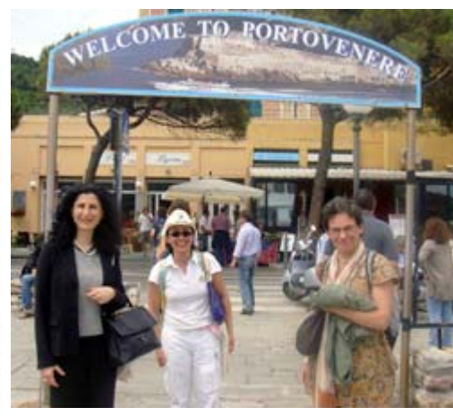
CINQUE TERRE, Italy — Cinque Terre ("five lands") alongside the

Italian Riviera between Genoa and Pisa consists of five coastal villages hanging on the cliffs with vineyards and olive tree terraces. These were matched with our five Ifugao Rice Terraces ( cinque terrazzo de riso ) in the Cordilleras by the World Heritage Committee, which is hoping to remove the latter from the List of World Heritage Sites (WHS) in Danger.