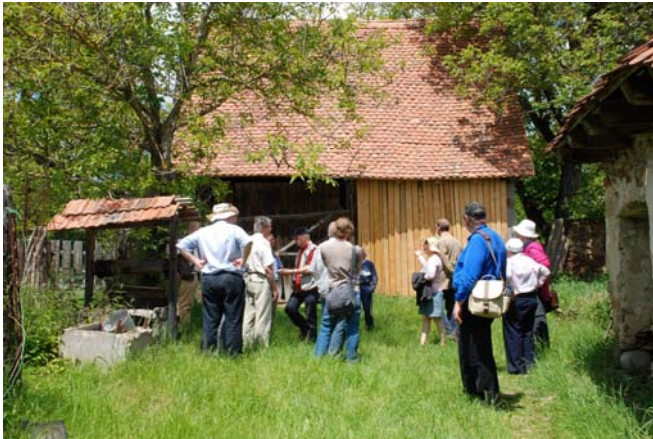
Visiting Rosia Montana