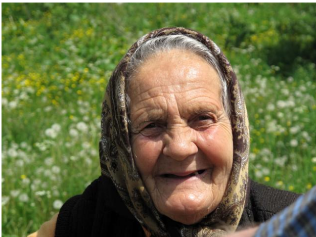
Old and happy