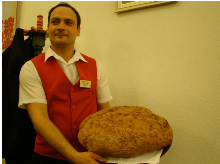
The bread in Transylvania

This issue is dedicated to the CIAV Conference in Romania and the post conference tour. All of us who participated in this incredible trip enjoyed all the new experiences very much, the rural vernacular architecture, the remarkable churches and monasteries, the different landscapes, the way of life, but above all: the people. We have been received with warm welcomes everywhere; we have tasted the local and traditional food, accompanied with wine produced in their own vineyards and homes, which was sometimes really strong, but so nice. It is also necessary, especially for me and other colleagues who don't live in Europe, to mention the bread. We were pleasantly surprised with the traditional local bread baked in firewood ovens. It was so delicious.