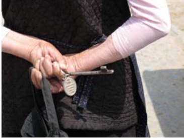
Key to our hearat -n