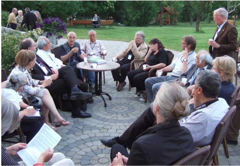
Working hard at the Conference.