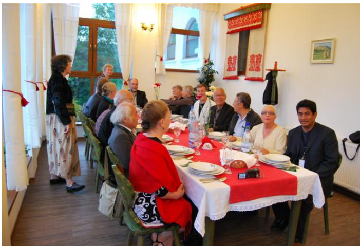
Dinner at the end of the conference