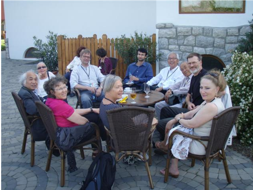
Coffee break at the conference hotel.