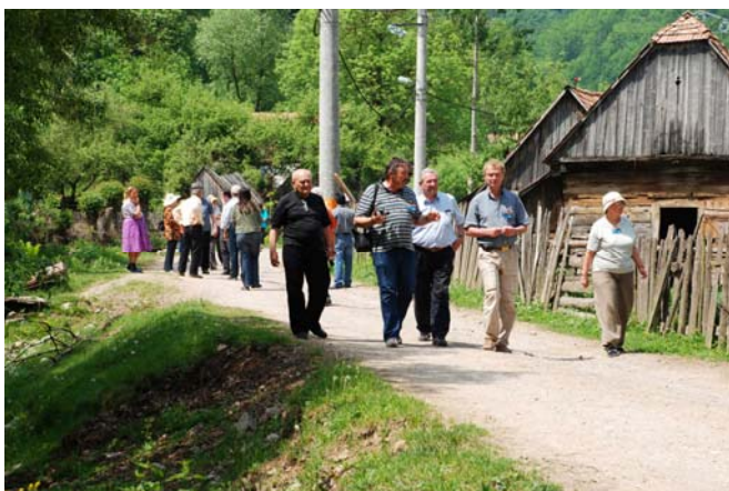
The group stop at the very much vernacular village of Ocolis Aklos