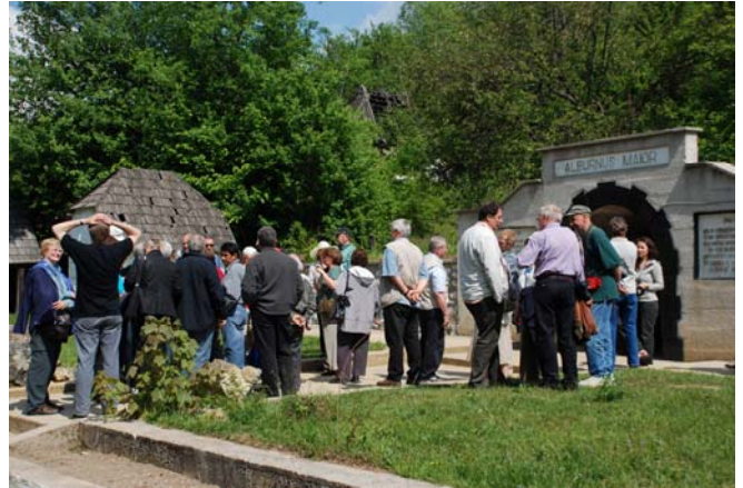
Entrance to the Gold Mine of Rosia Montana