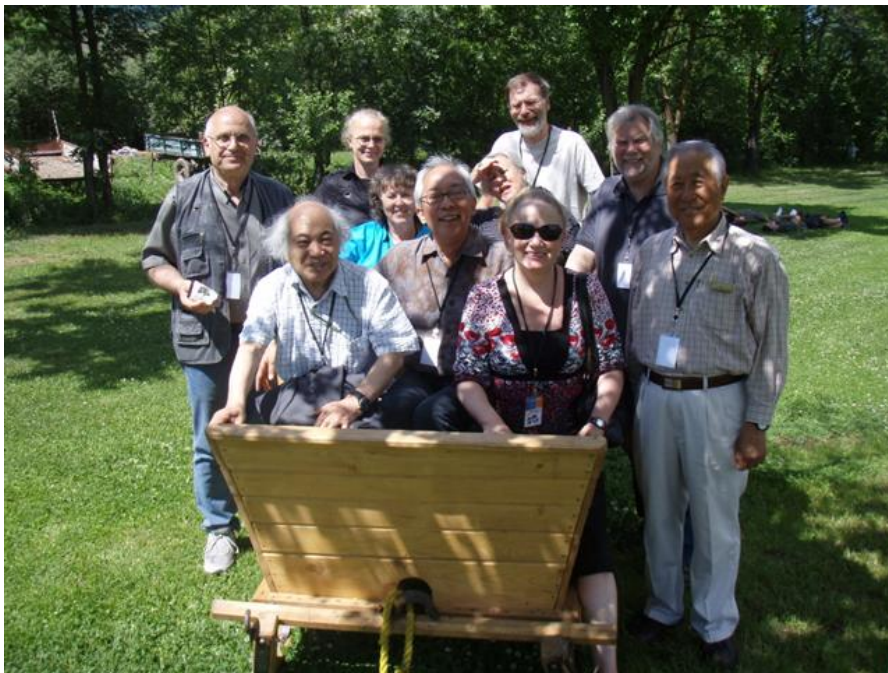
Everybody enjoy sunshine at the Coltesti Hotel.