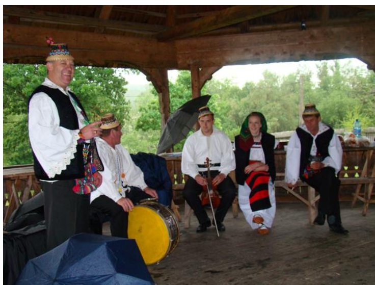
Reception at the Open Air Museum of Sighetu Marmatiei