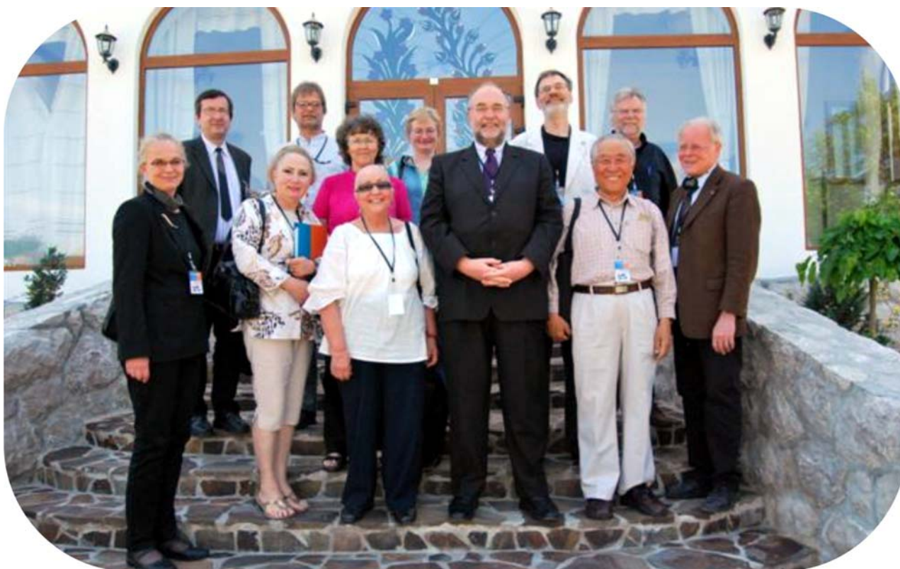
Everybody happy at the Conference Hotel in Coltesti, close to Rimetea