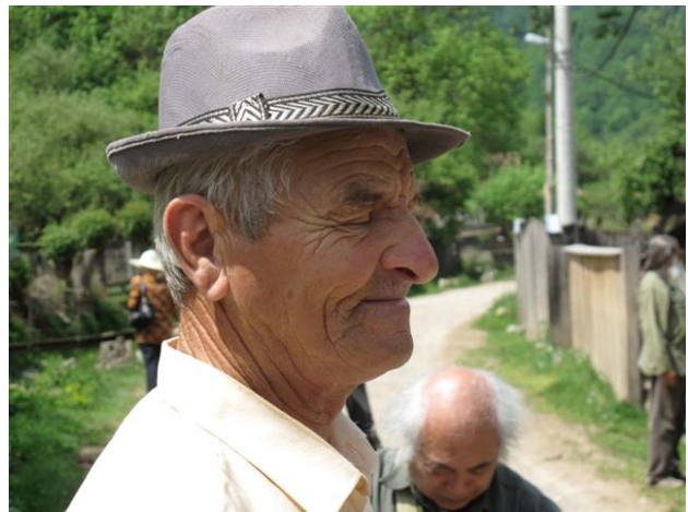
One more friend on the road