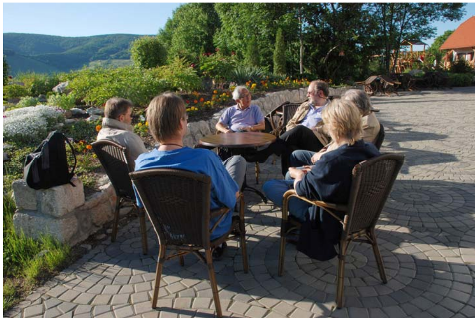
At the Hotel Szekelly in Coltesti during the Conference