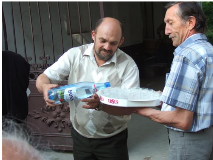
Serving el Aqua de Vita by our Romanian friends.