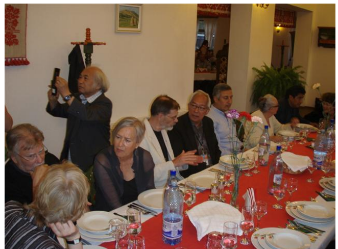
Lunch Time.