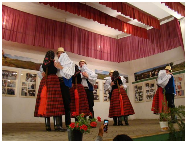
Traditional dance during reception dinner at Rimetea