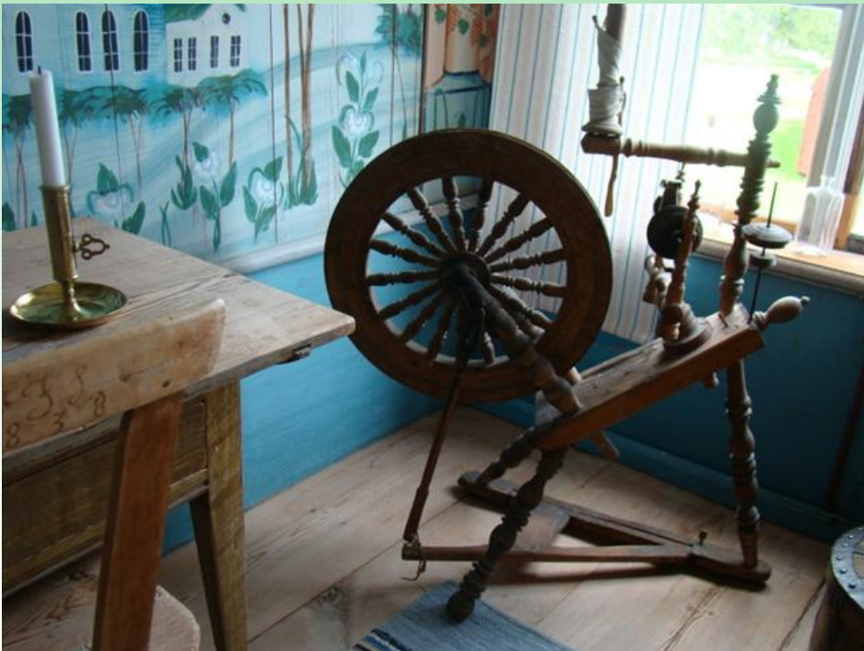
Wall paintings in a rural farm In Hälsingland