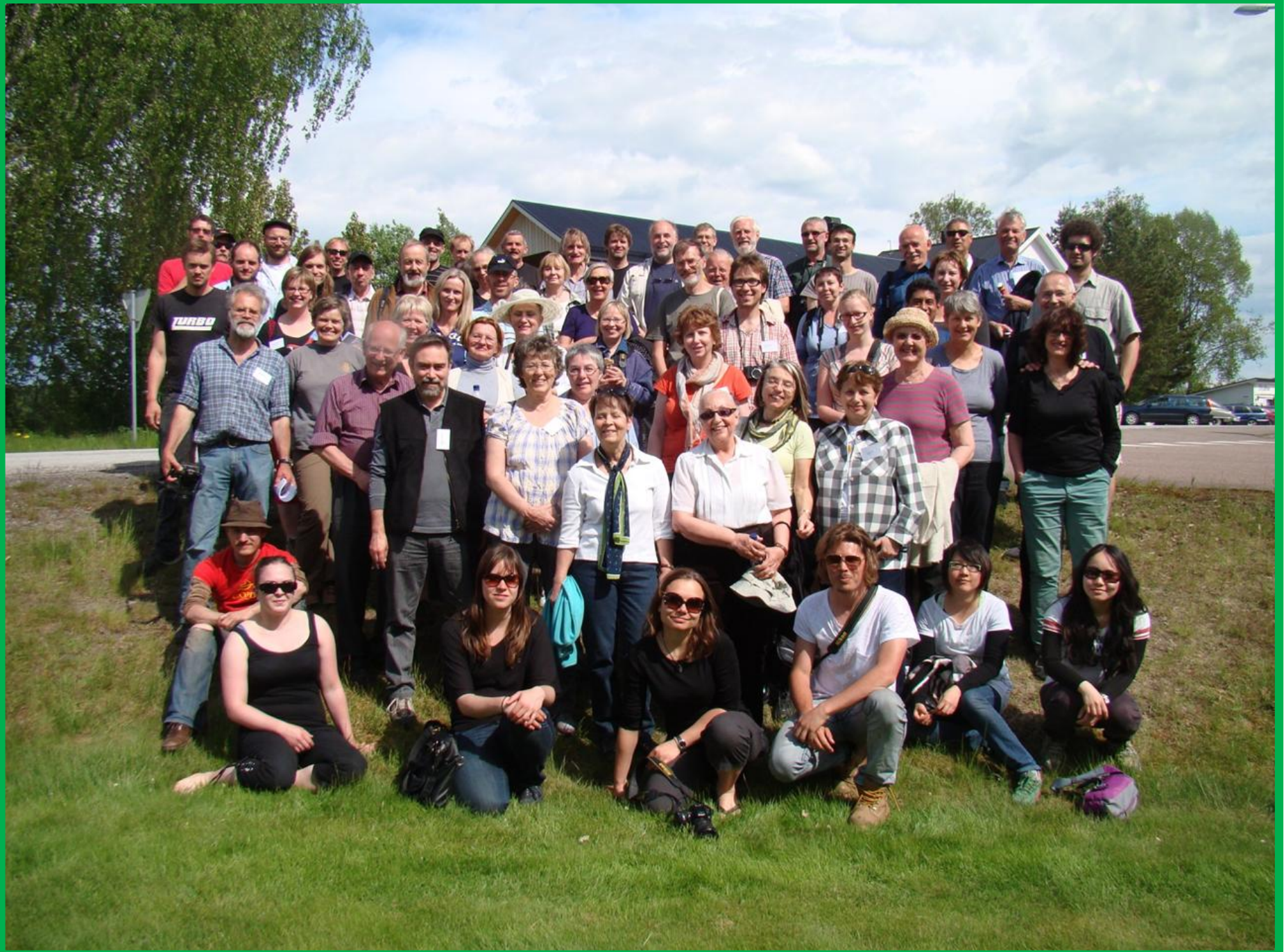
CIAV ANNUAL MEETING AND SEMINAR FINNSKOGEN 2010 VERNACULAR CROSSING BORDERS