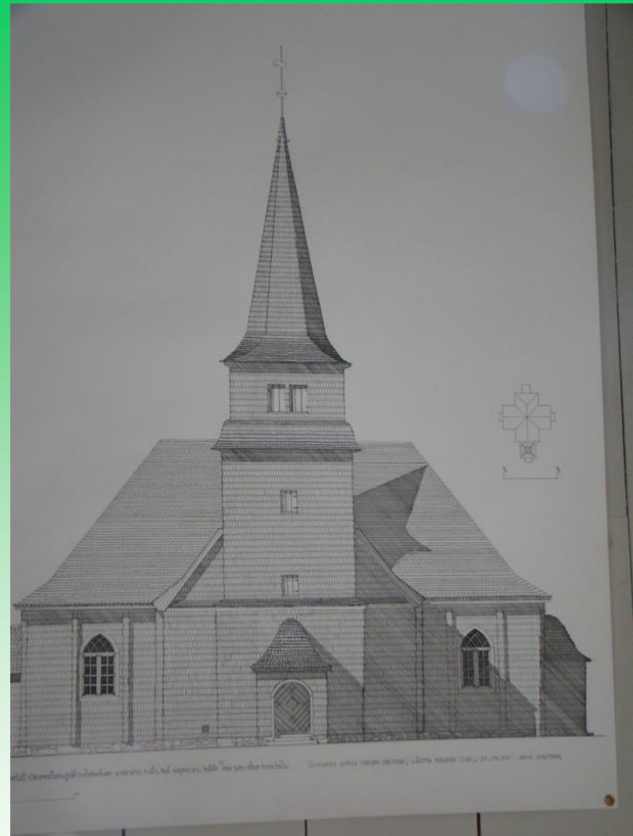
Visiting and opening the CIAV VERNADOC 2010 exhibition

“CIAV VERNADOC 2010” measure-documenting camp organized by Markku Mattila. Measuring and drawing the cross border building tradition of Finnsylvania: the wooden church of Östmark