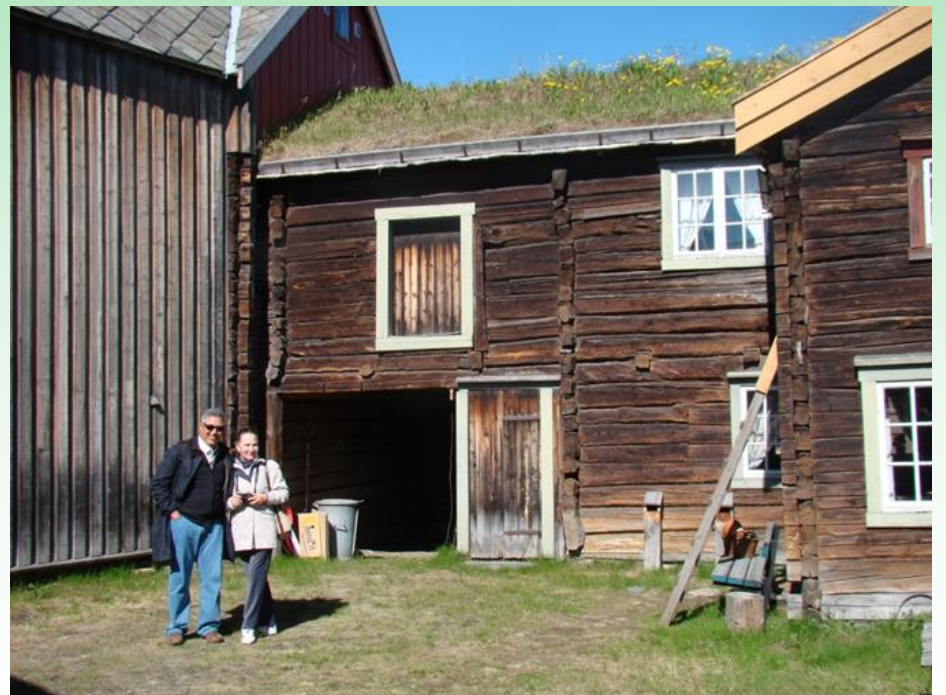
Roros, Norway, mining town, World Heritage Site