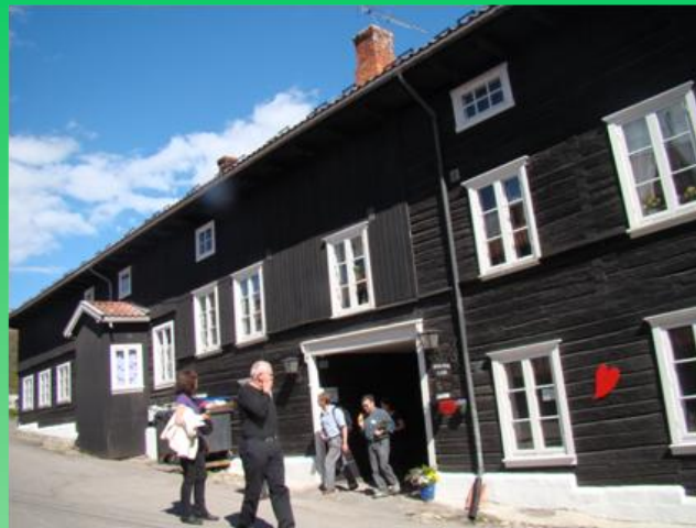
Visiting traditional neighborhood In Konsvinger