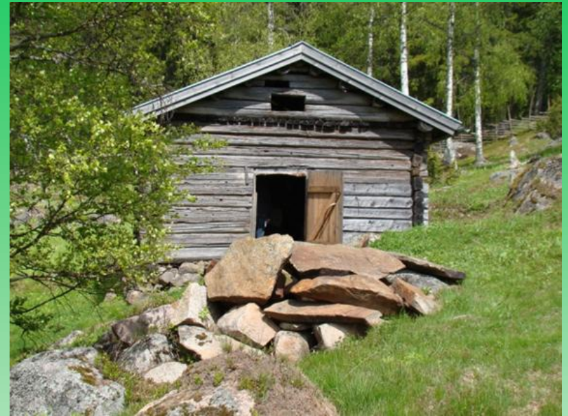
Juhola, farm with many buildings, house for living c.1750