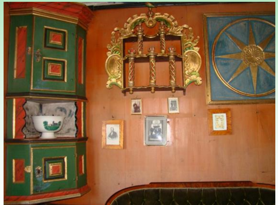
Our CIAV group visiting this traditional farm