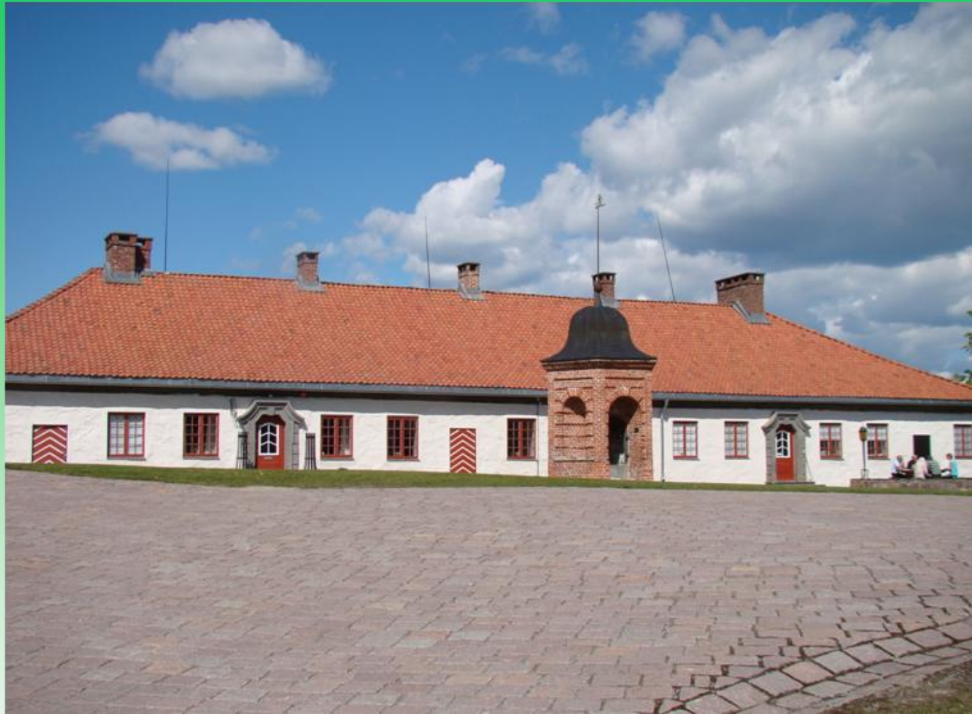
The fortress in Konsvinger

Once more CIAV members came together in Norway to celebrate the CIAV Annual Meeting and Seminar that took place in Konsvinger, Finniskogen region. The seminar's theme was: Vernacular Crossing Borders.