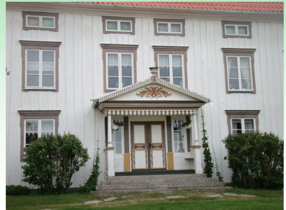
Farms in Hälsingland with richly decorated porches