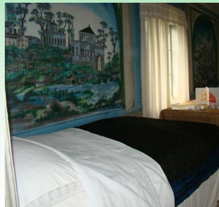
Farms in Hälsingland with wall paper and wall paintings