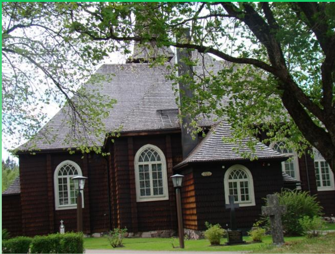
Östmark church 1765

“CIAV VERNADOC 2010” measure-documenting camp organized by Markku Mattila. Measuring and drawing the cross border building tradition of Finnsylvania: the wooden church of Östmark