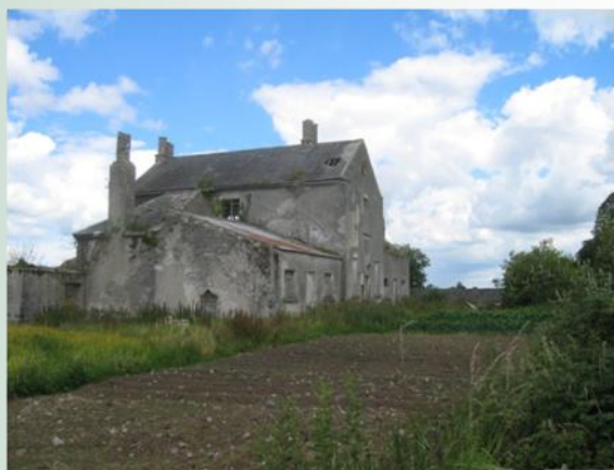
Still in use, Glegarragh, Co. Waterford