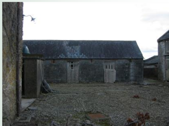
Farm adapted to resident use

The utility of the design of the farmyard layout spread to other farmholdings with the introduction of winterfeeding, animal houses were kept close to the house, with the dairy being attached to the main house and the granary at the entrance to the farmyard.