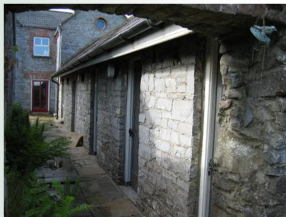
Cut-stone animal building, Co. Tipperary

To give the foreign visitors a glimpse of the Irish context, Deirdre gave a short presentation using images of 19 TH century farm buildings revealing the range and diversity of vernacular styles as a reminder of how these buildings shape the character of our landscape.