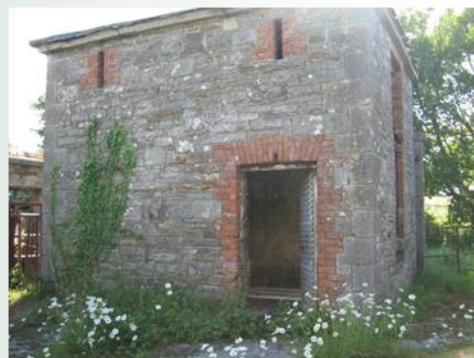
A granary, Mount Trenchard, Co. Limerick