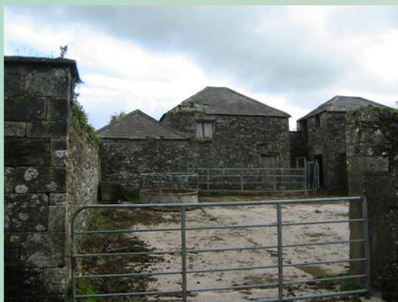
Kyle Park Model Agricultural school, Borrisokane