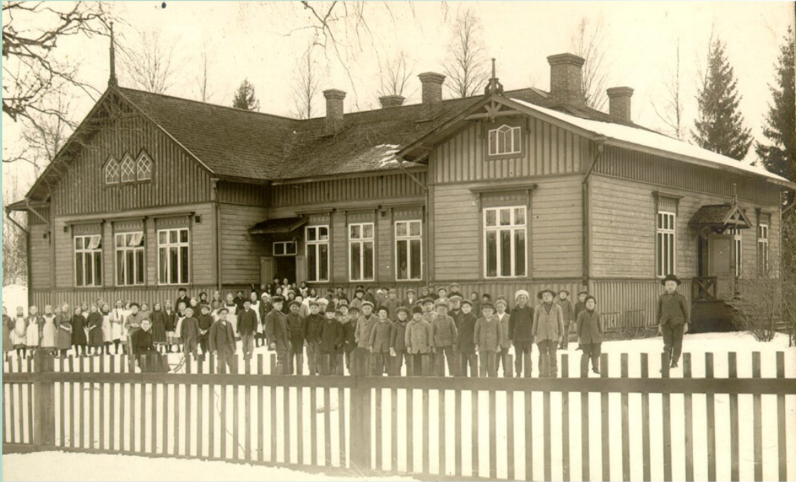
Object of the work: Pekkala School in Ruovesi, built 1891

Time: two weeks in the beginning of August