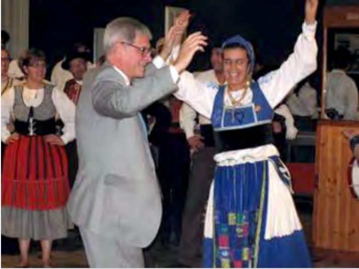
A reception with traditional music, dances and dinner.