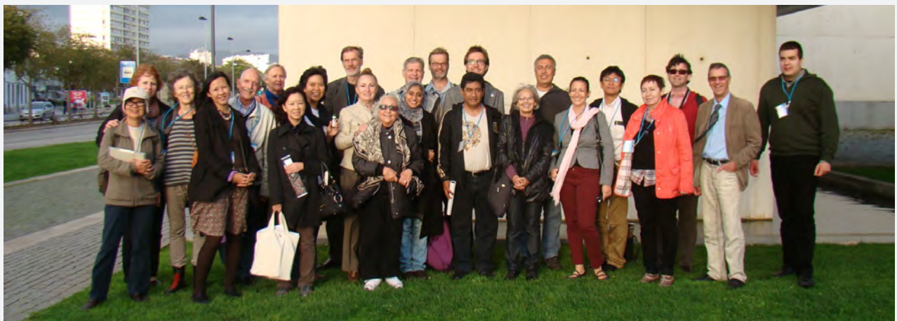
CIAV group at the end of the visit to Viana do Castelo