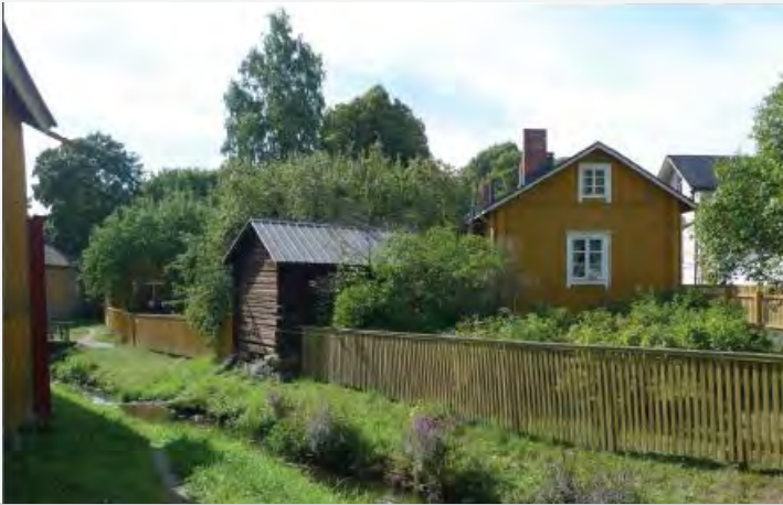
The research object of Finn VERNADOC 2013 was the Kirsti-house in the wooden WH-town of Vanha Rauma.