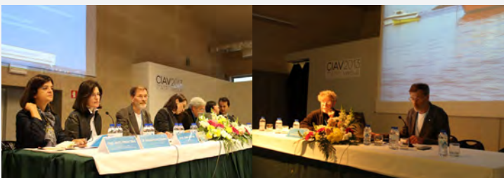
Views during the Conference