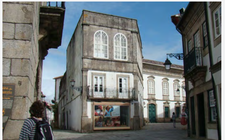
CIAV group visiting Viana do Castelo