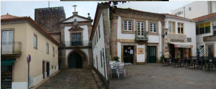
Views from Vila Nova