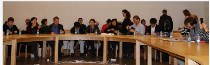
Images from CIAV Meeting. Discussion with the participation of all the members