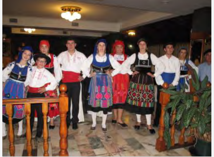
A reception with traditional music, dances and dinner.